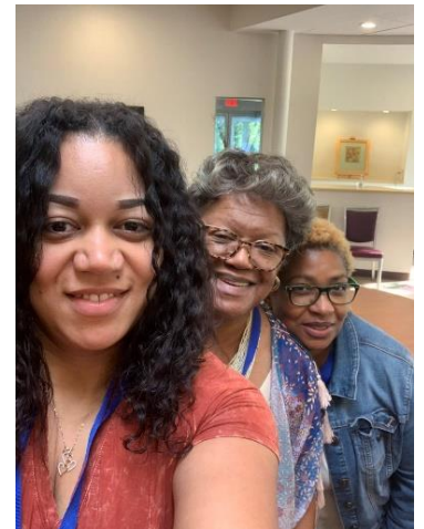
CELEBRATION CLOSE OUT GROUP PHOTO